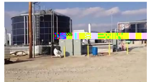
Another instructor-guided video tour: a solid waste-treatment plant that Dill is also working on.

Although online programs give the student some latitude to choose when he or she studies or works on an assignment, the extra rope is fairly short — the latitude is only within the day. That means working at midnight instead of 7 p.m., for instance, not skipping whole days. The College's M.S. program has strict deadlines to meet — one in the middle of the week and one on Sunday night. Each course is eight weeks long, and each has an authentic learning project, so that's a lot of deadlines. There are ten courses in all — 30 credits — for the degree.